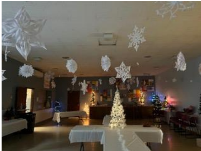
The church decorated for Christmas Eve