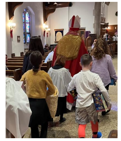
Our Toys and Out of the Cold Houses Will be Blessed, too.