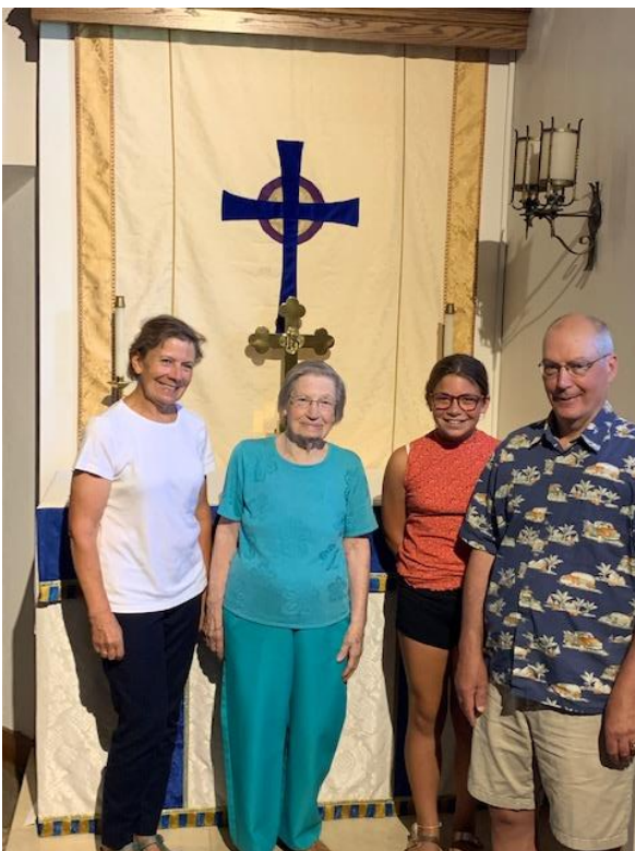
Presentation of the Dossal