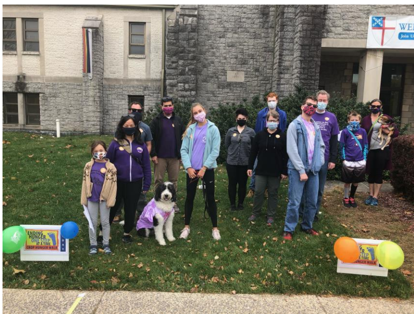
Last Year's CROP Walk at St. Andrew's