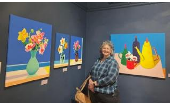
Art by Ryoo Jaebee