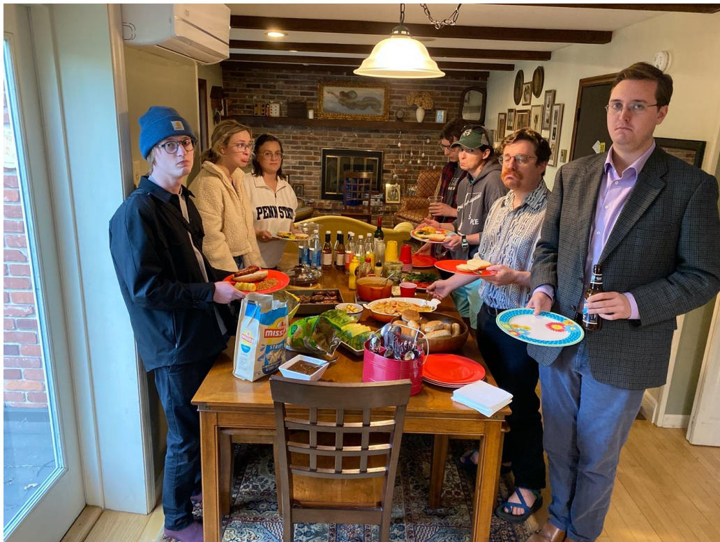
(Our 'sad' picture – because not everyone could come to the end of semester cook-out!)