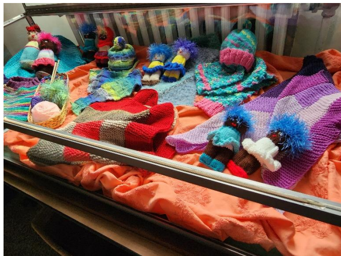
Current display in the Narthex of items made by members of the Knitting Ministry

The final 2022 date is December 11. All are welcome!