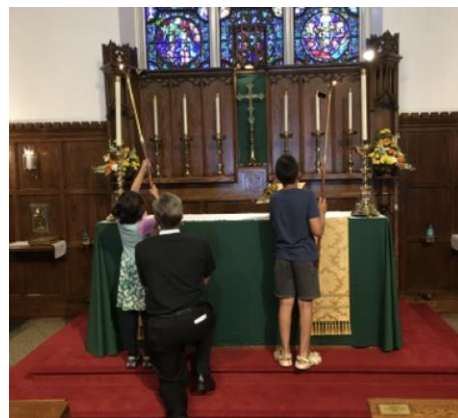
Acolyte training from this summer