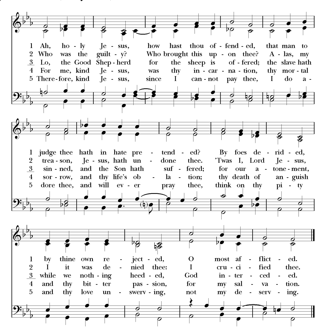
Hymn 158 "Ah, Holy Jesus, How Hast Thou Offended?" Herzliebster Jesu