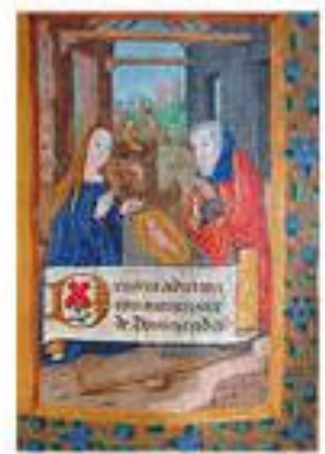
A FESTIVAL OF NINE LESSONS AND CAROLS