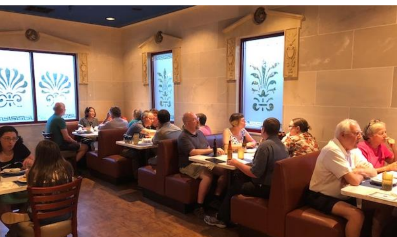
Thank you to all who came out to support our fundraiser at the Greek in August. The turnout was overwhelming – it seemed like every table was full of St. Andrew's members and friends. Everyone had a great time, a delicious meal and helped us raise money for our pilgrimage. I'd call that a success!